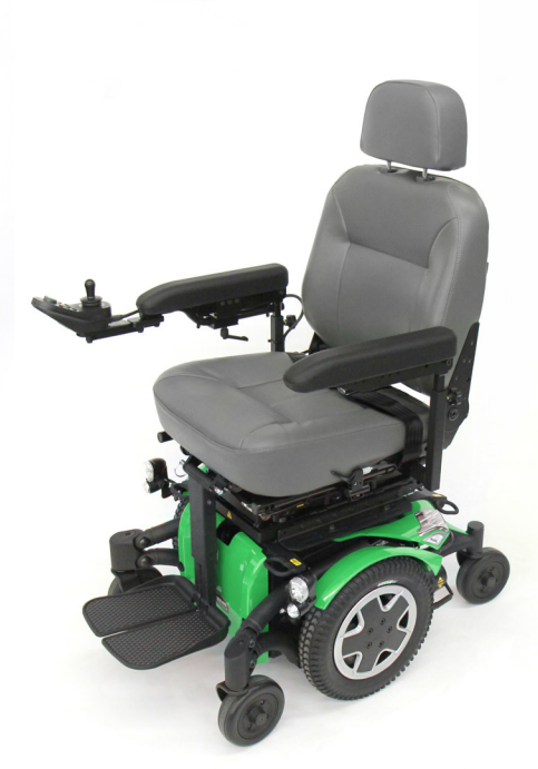
Heavy-Duty K0851* TDXSP2V-HD

Also available K0850* with Solid Seat Pan