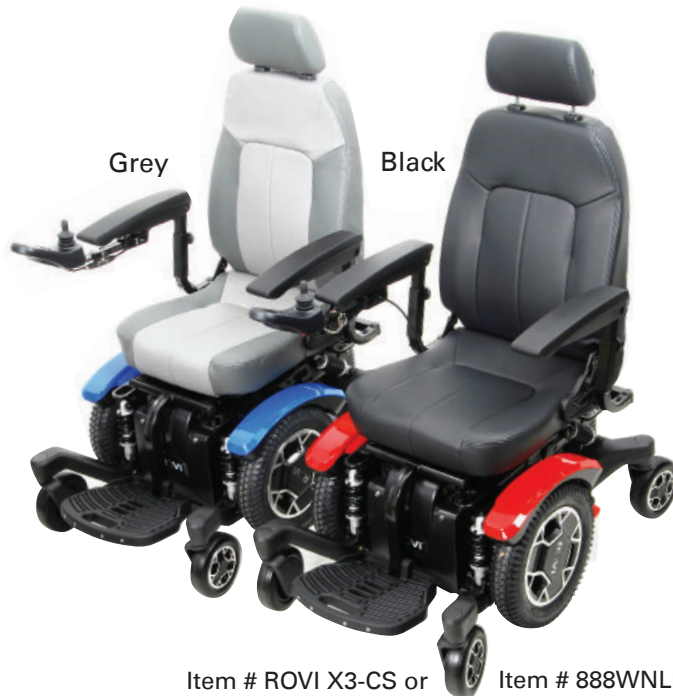
Item # ROVI X3-CS or Item # 888WNLEX3-SP-CS