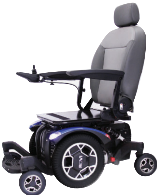
Item # ROVI X3-SS or Item # 888WNLEX3-SP-SS