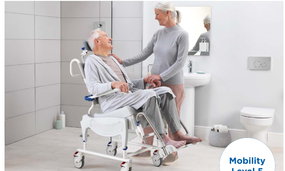
Mobility Level 5